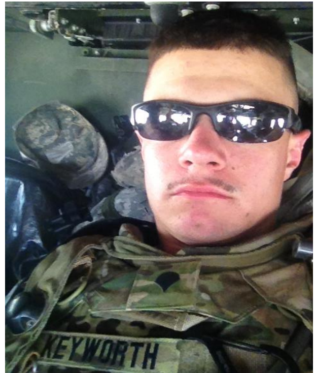
"That's right, I'm the coolest dude in this vehicle."